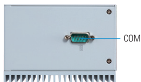
▲ Bottom view