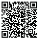
K120 3D demo